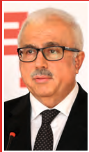
Niyazi Safarov Deputy Minister of Economy of the Republic of Azerbaijan