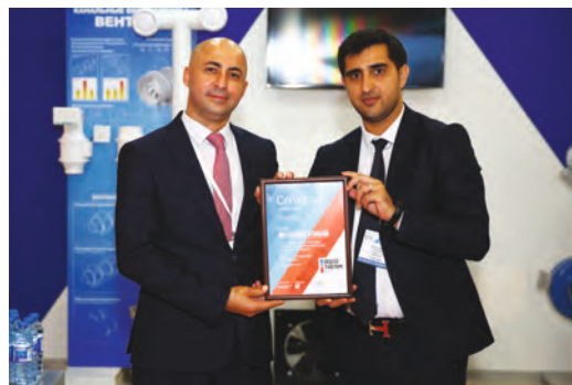
The Best Customer Attraction