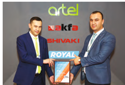
The Best Service Presentation