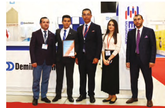
The Best Stand Design