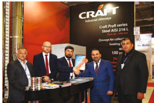
The Best Product Presentation

Special achievement certificates were awarded to participants for their creative approach to the design and decoration of exhibition stands. This has become a tradition initiated by the organisers. Winners of this year's achievement certificates are: