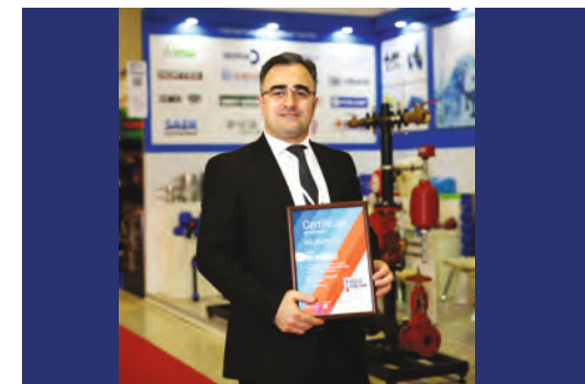
The Best Performance