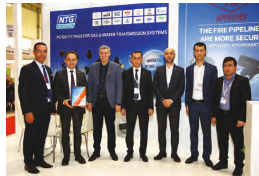
The Most Active Work with Visitors